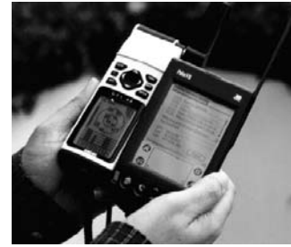
Figure 2: PDA (Palm VII) with GPS device

In the early stages of our agentized effort, we ran the agent proxies to coordinate real meeting schedules for a subgroup of five agentized people, working on five workstations and also equipped with two PDAs and one Global Positioning Service (GPS) device (providing accurate information about a user's location), as in Figure 2, over the course of two weeks. Teamcore proxies managed team-level commitments (i.e., meetings), and Friday agent proxies monitored individual users' locations and made decisions about what